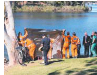
TRAGIC: Police at the scene.