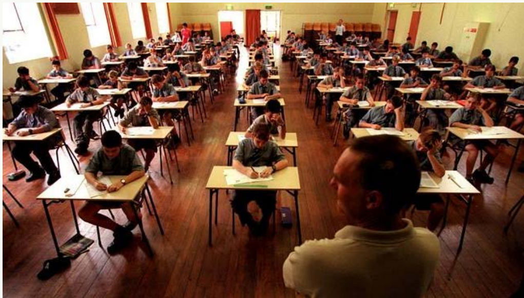
The SA Liberals say Year 7 would be moved into high school if they were to win government.

YEAR 7 will be merged into high school if the Liberals win power in March in a move they say will deliver better results for students by providing earlier access to specialised teaching.