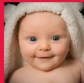
Paid Parental Leave