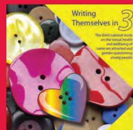
Homosexual Students Find Their Voice