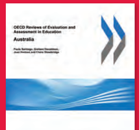
Australia's Report Card