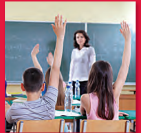
Class Size vs. Teacher Quality