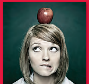
Teacher Renewal Program