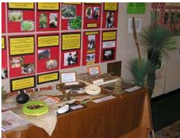
This picture shows the display from North Haven School featuring products from the Aboriginal plant use trail.

Congratulations to all the schools and preschools that contributed to such a fantastic demonstration of how our community is moving towards sustainability with our young people.