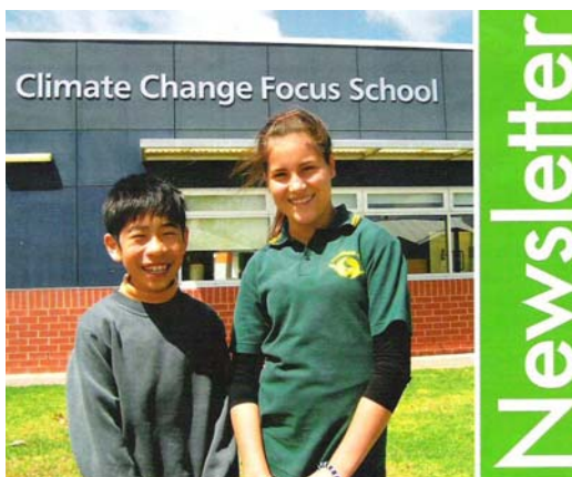
Cowandilla Primary School shares their sustainability focus with the whole community

By subscribing you will receive emails that link you to information and opportunities to advance Education for Sustainability at your school or in your community.